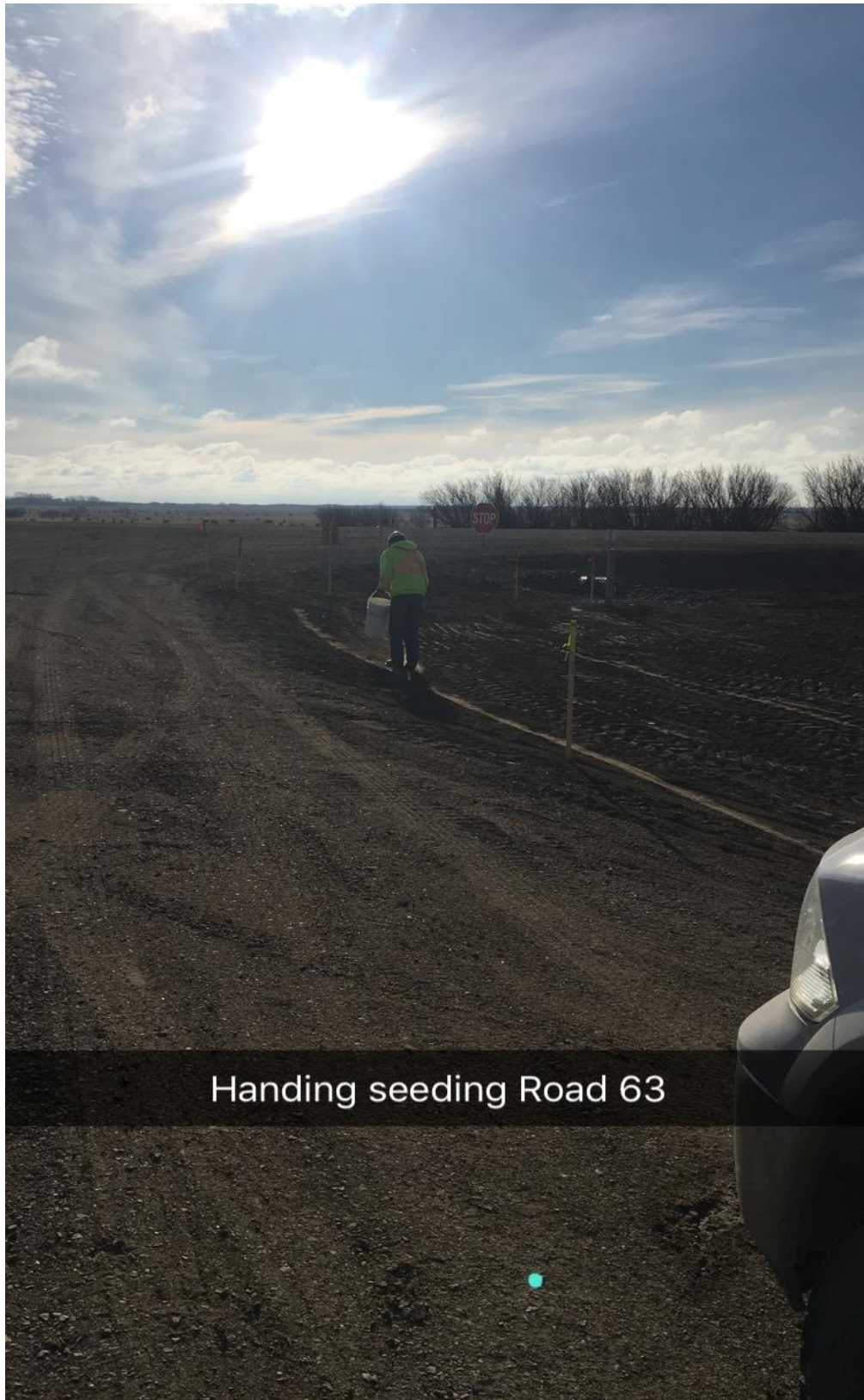
Handing seeding Road 63