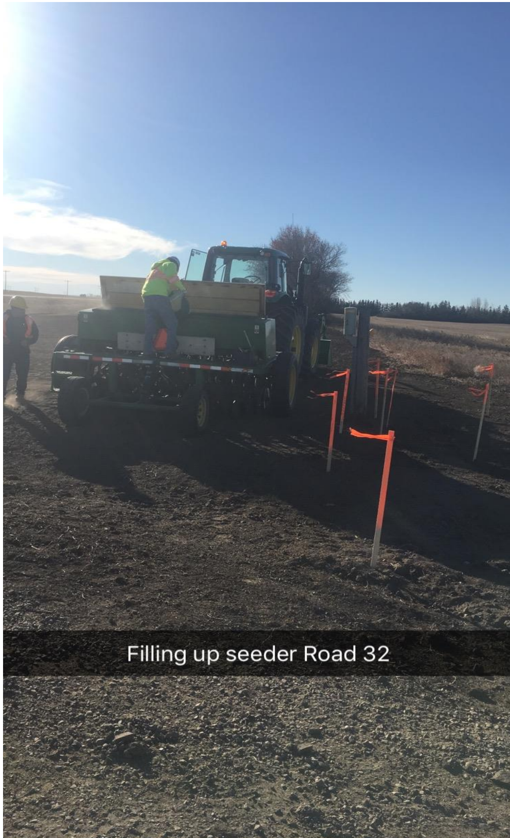
Filling up seeder Road 32