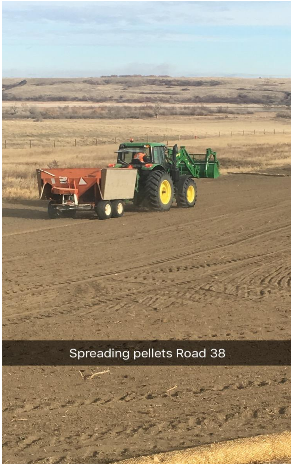
Spreading pellets Road 38