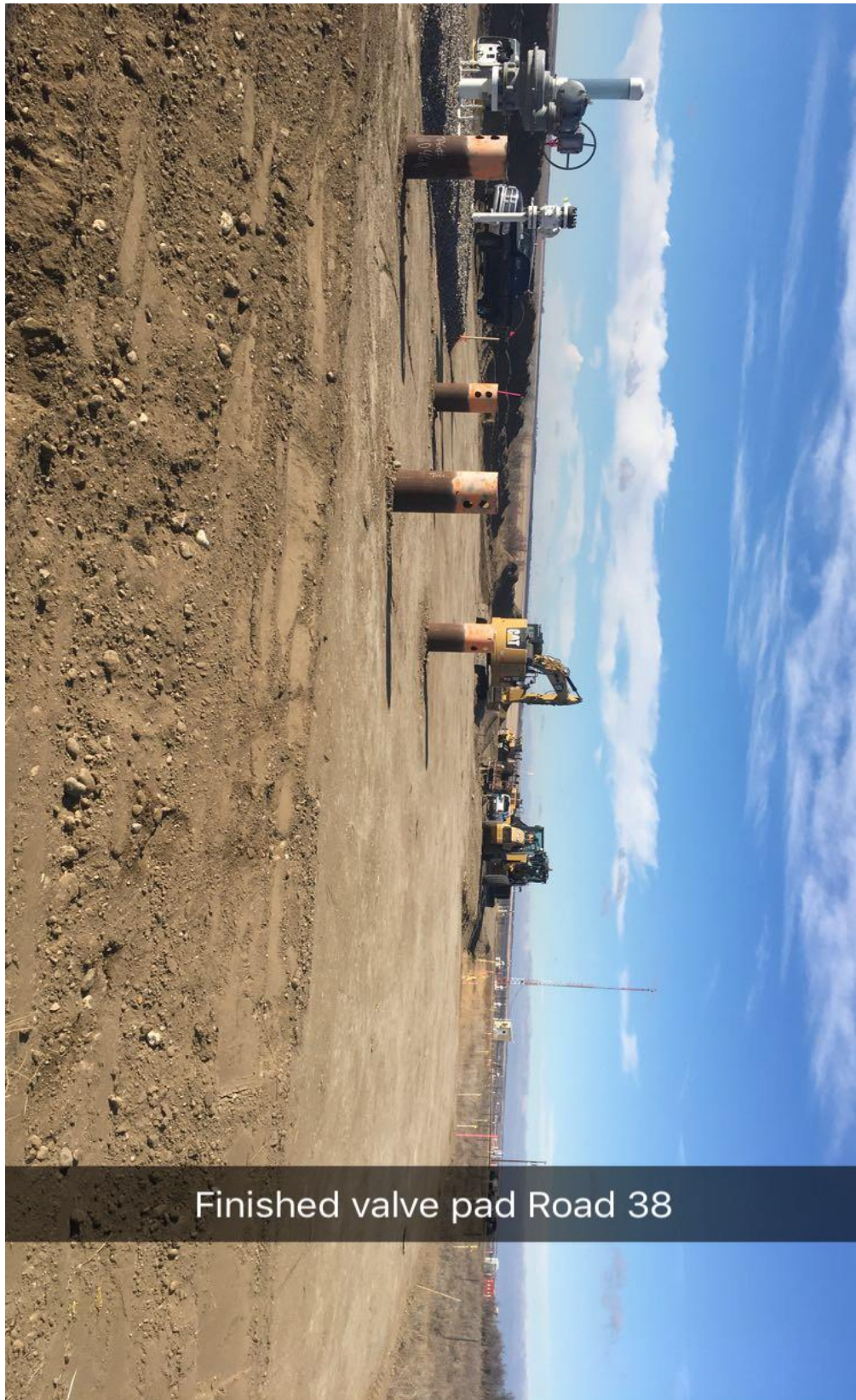
Finished valve pad Road 38