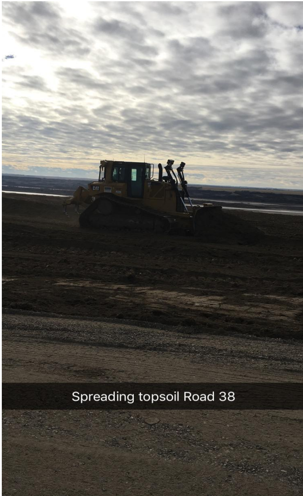
Spreading topsoil Road 38