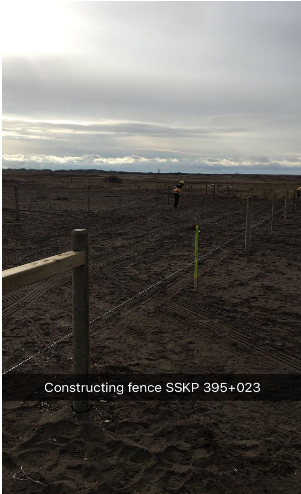
Constructing fence SSKP 395+023