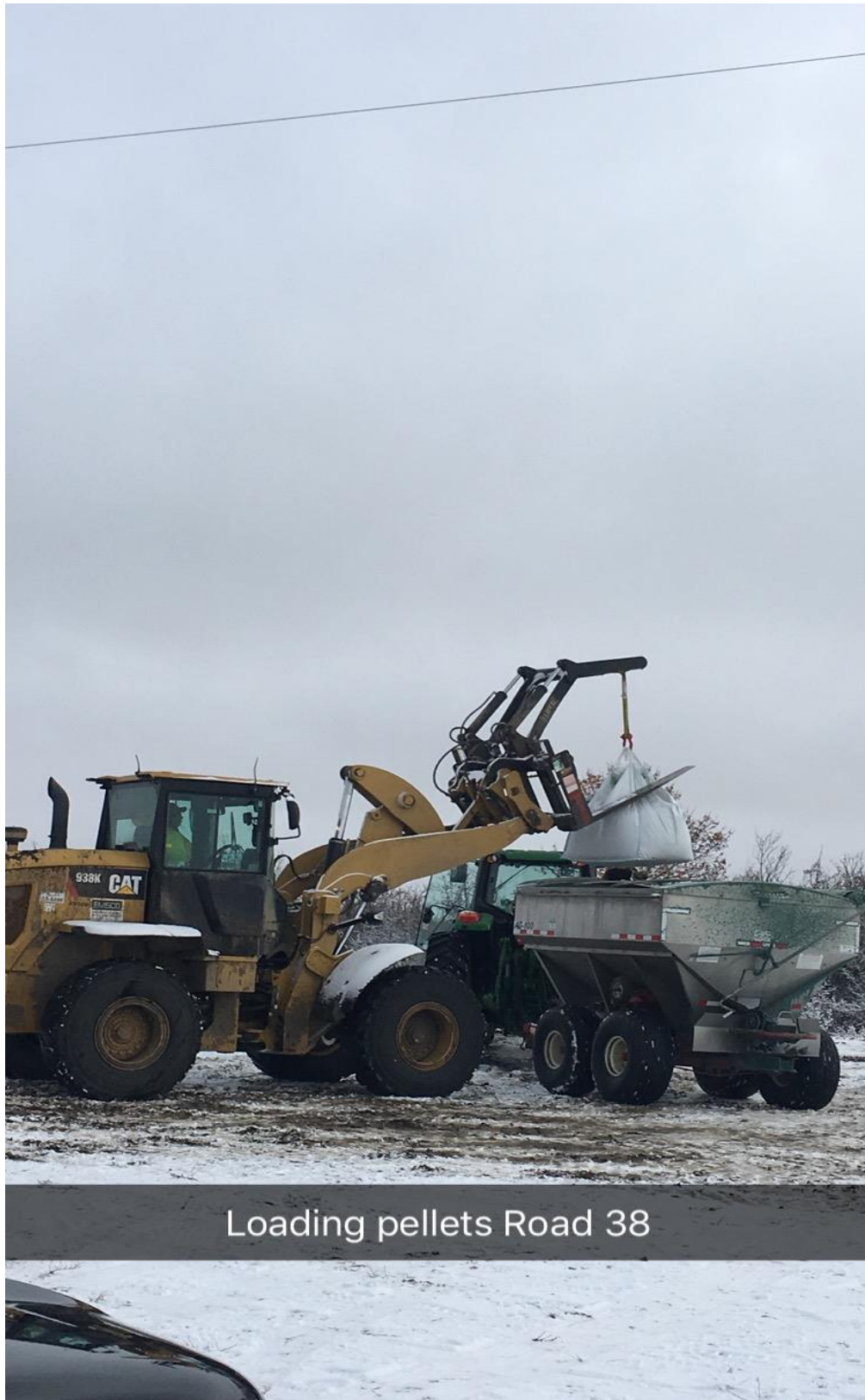
Loading pellets Road 38