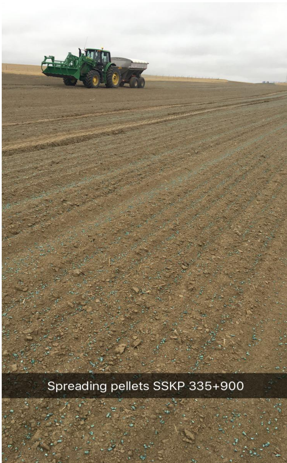
Spreading pellets SSKP 335+900