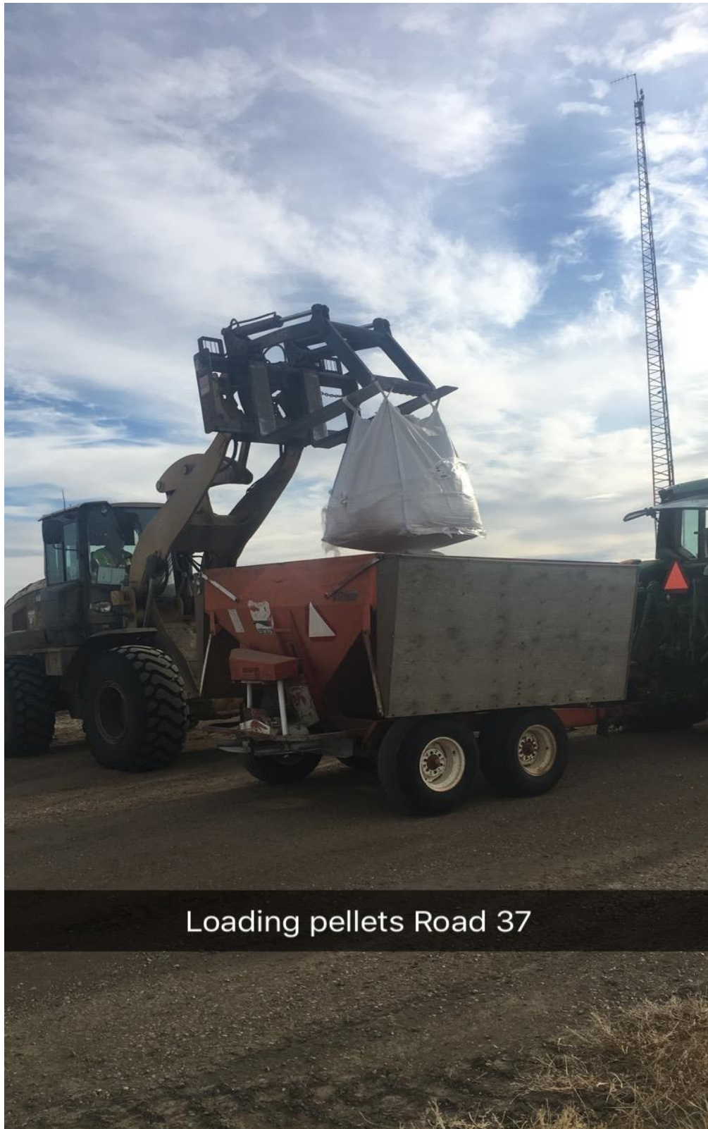
Loading pellets Road 37